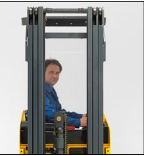
Excellent visibility through the mast