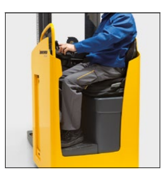
Comfortable seating position with height-adjustable footplate