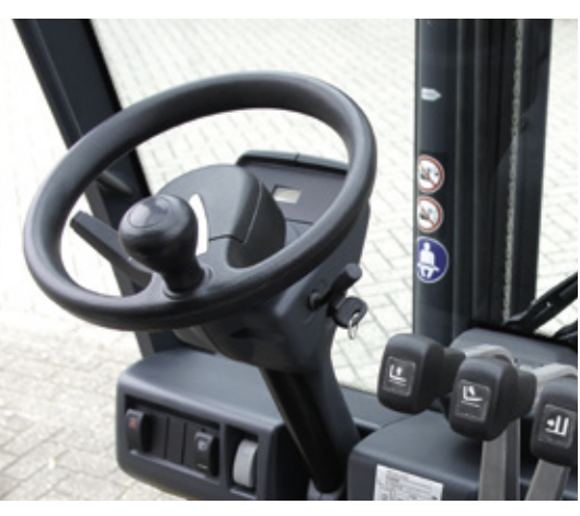
04 The slim steering column (with the travel direction lever on its left side) is infinitely variable