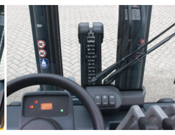
03 Visibility through the triplex mast is very good. The cylinders, chains and hoses have been positioned to optimise visibility