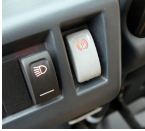
05 The grey switch activates the electrical wheel stop of the maintenance-free brake system

DFG/TFG series. Our test truck features excellent accessibility to the engine (fig. 06) and torque converter. The engine cover can be opened up wide and the two side elements can be removed without tools.