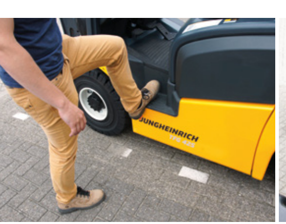
01 The entry / exit is generously dimensioned, pleasantly low and free of sharp edges

Jungheinrich met these challenges and after an extensive development phase introduced the TFG and DFG truck series with capacities between 2.5 and 3.5 t to the market. Although more simply designed than other series, these trucks are still Jungheinrich at their core. This includes our test truck, the