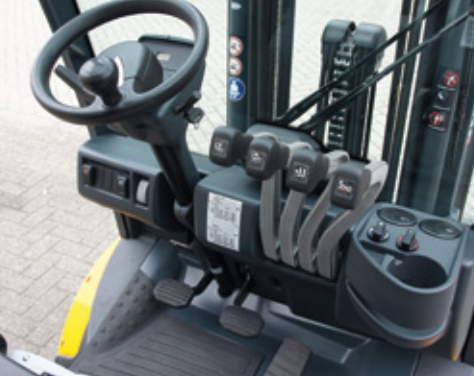
02 There is sufficient space available to comfortably operate the pedals, crawl speed and brake as well as the accelerator