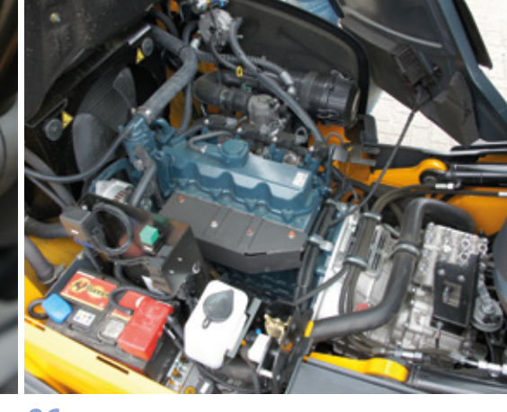
06 The engine compartment, which houses the economical drive, can be easily reached without using any tools

Our test truck was stable and sturdy in operation, lending it a predictable quality. The truck owes its sturdiness in part to the premium Xtreme solid rubber ty-