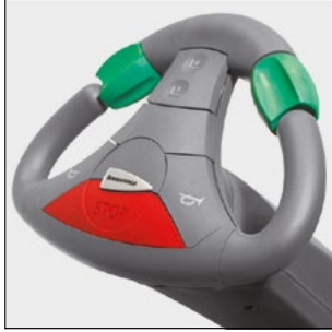
jetPILOT steering wheel / operating functions