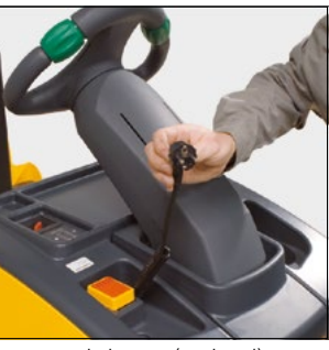
Integrated charger (optional)

Chassis made of high-quality 8 mm sheet steel