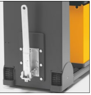
Different couplings available (optional)

• Extra high chassis apron on front cover