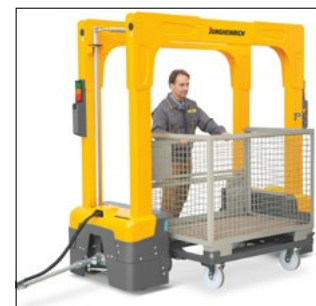
The portal design allows loads to be pushed out