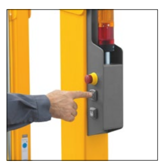
Lifting and lowering via buttons at an ergonomic height