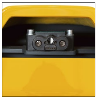
Electrical connection for trailers