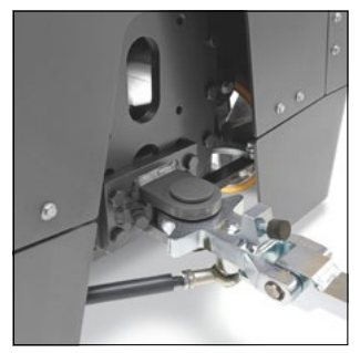
All-wheel steered frame (optional) for excellent directional stability