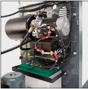
Good accessibility to all components