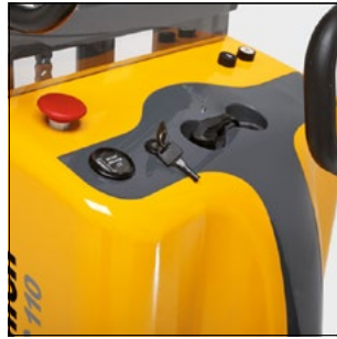
Clear arrangement of all operating and display controls