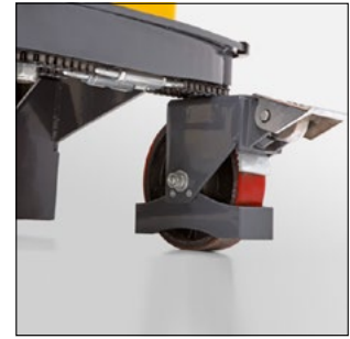
Steered wheel with parking brake