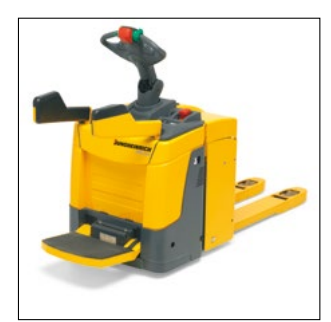
ERE 225 with foldable stand-on